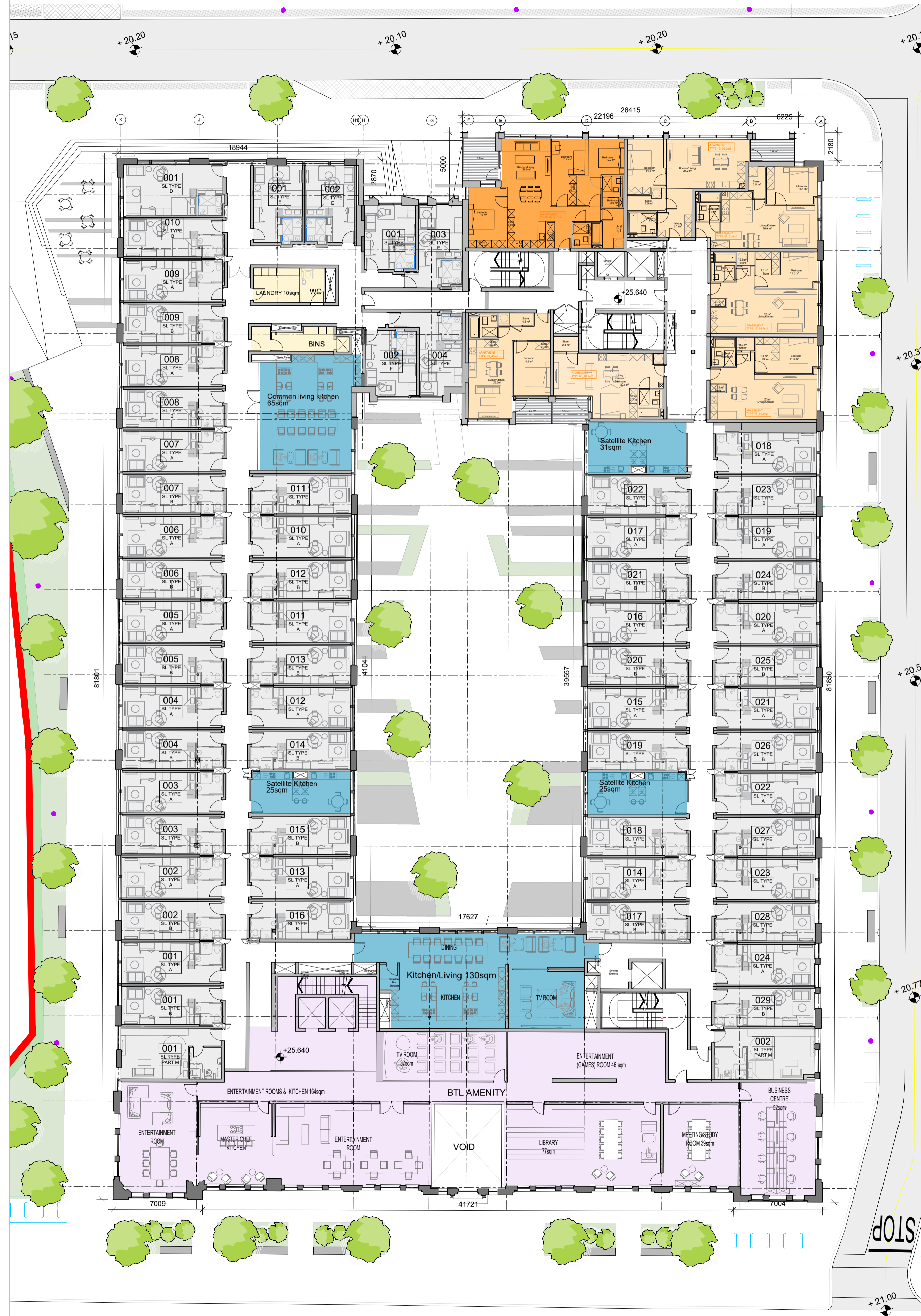
01 PW1 FIRST FLOOR PLAN PL1101 SCALE 1:200

NOTE ALL DIMENSIONS TO BE CHECKED ON SITE NO DIMENSIONS TO BE SCALED FROM THIS DRAWING THIS DRAWING IS TO BE READ IN CONJUNCTION WITH RELEVANT CONSULTANTS DRAWINGS