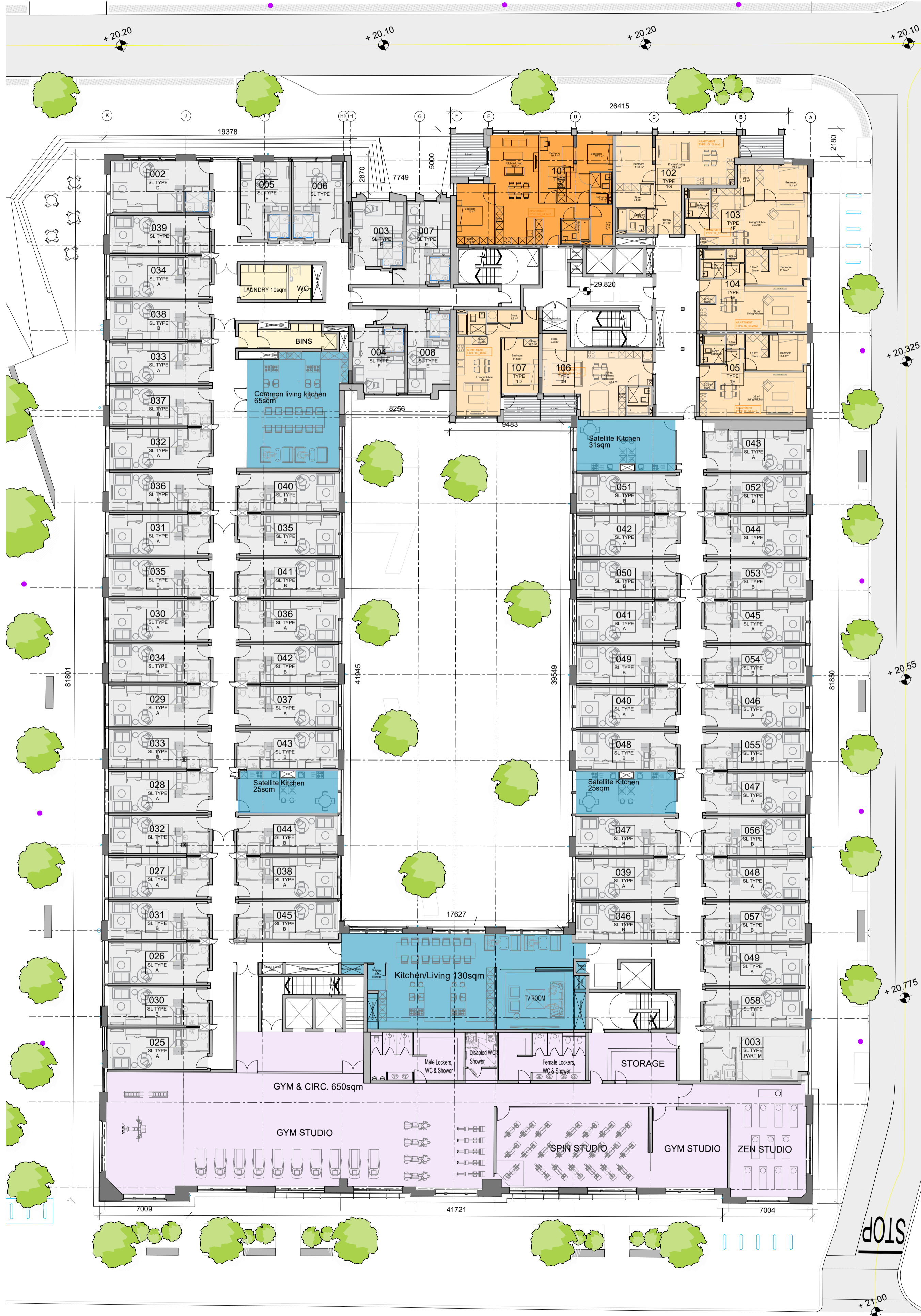
02 PW1 SECOND FLOOR PLAN PL1102 SCALE 1:200